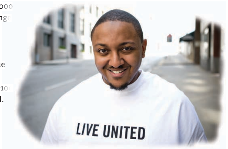
During the 2010 tax preparation season, United Way, with support from Citizens Bank and the Walmart Foundation, funded 21 VITA sites throughout Rhode Island.