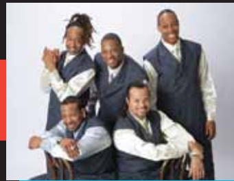
WORLD PREMIER BAND