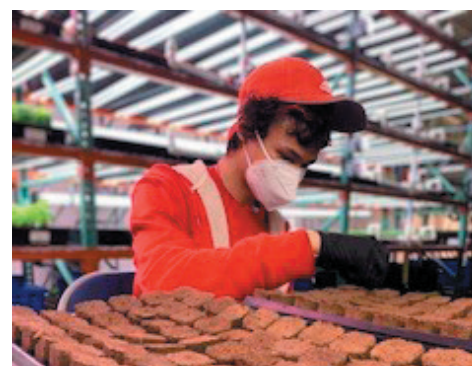
ABOVE Greens Do Good: Hydroponic farm training for young adults on the autism spectrum

With a global focus, particularly in the US and Africa, SEC challenges all of us to build supportive, inclusive communities so every child will have the opportunity to flourish.