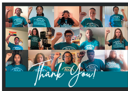
AT LEFT Communication devices for students with special needs (far left), and Boch Center City Spotlights Summer Leadership Program for youth